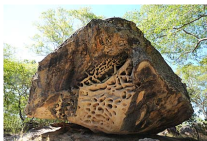
Dove Rock – Mwabvi WR

Nevertheless we need to raise much more than has so far been achieved if we are to be successful in the long term. So how can you help? Well one way might be to join us on the Mwabvi Ordeal 2009 ; an ambitious sponsored bike ride through Malawi in March 2009! www.projectafricanwilderness.org